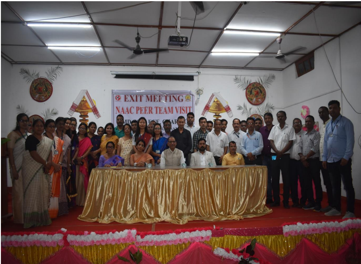
NAAC Peer Team with the college family.