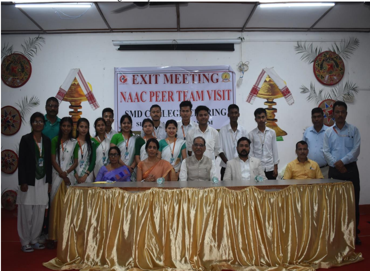
NAAC Peer Team with students.