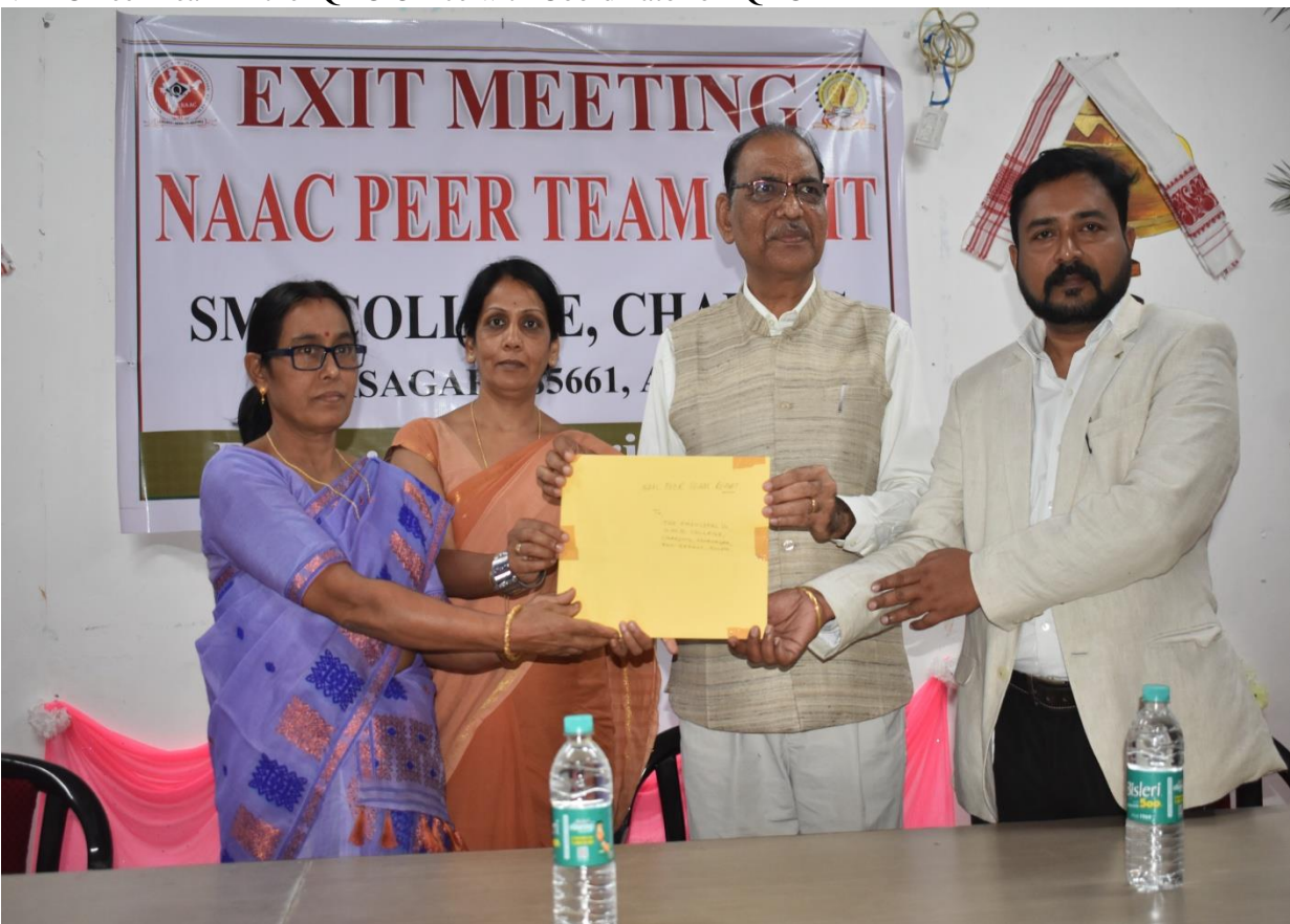
Peer Team conferred the confidential report to the Principal