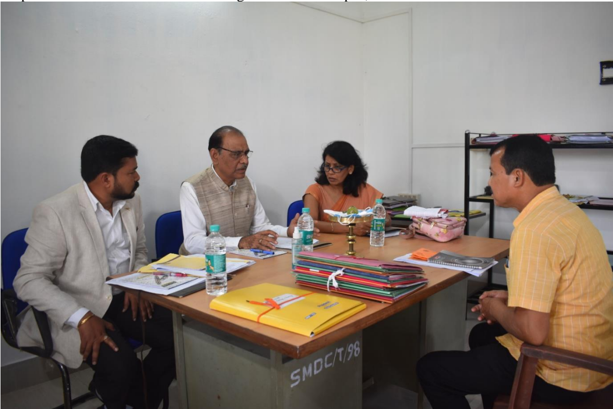
NAAC Peer Team in the IQAC Office with Coordinator of IQAC

Snapshots from NAAC visit in the college on 9 th & 10 th April, 2023