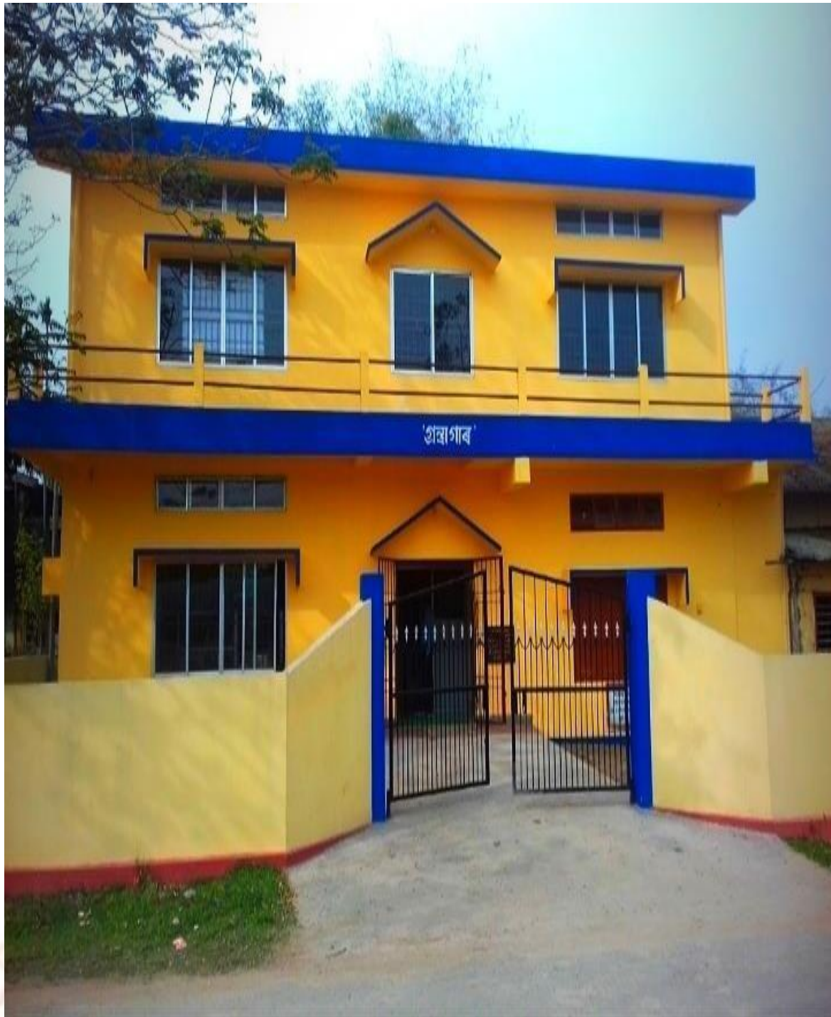
S.M.D. College Library